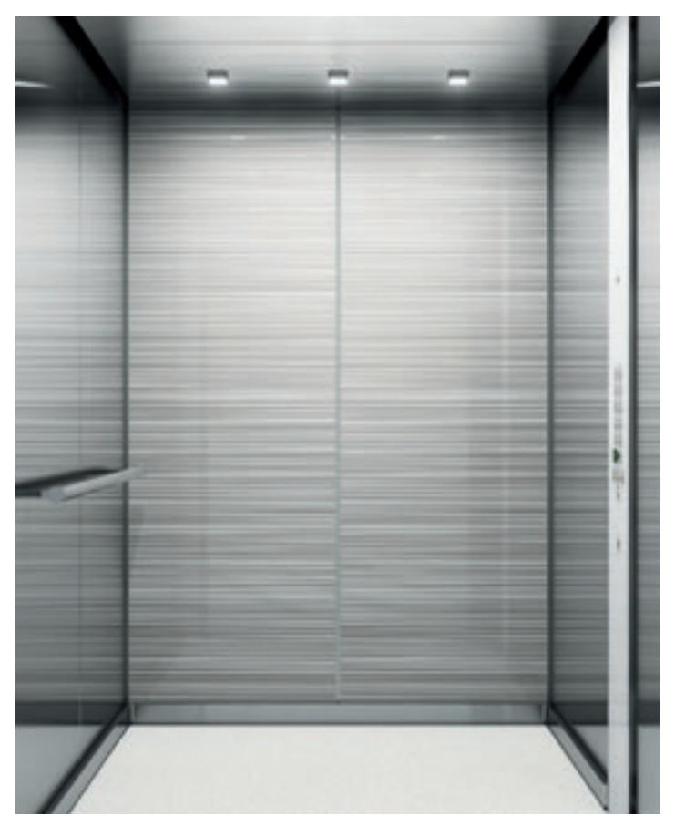
A stylish car interior, with award-winning KONE Design signalization, is an attractive feature in any building.